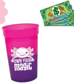
Mood Cup OR $5 Cookie Dough