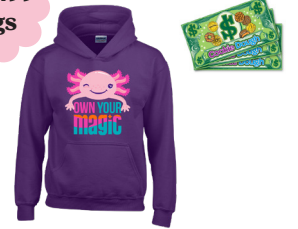
Hoodie OR $10 Cookie Dough