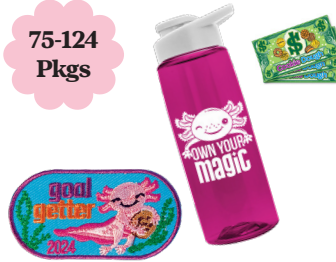
Goal Getter Patch & Flair Bottle OR $5 Cookie Dough