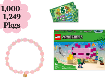
Dee Berkley Bracelet OR Lego Axolotl OR $30 Cookie Dough