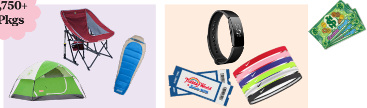
Camping Bundle OR Activity Bundle OR $75 Cookie Dough

Early Recognition 210+ packages presold by January 10, 2024