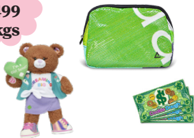
Build a Bear GC OR Zion Sling Bag OR $50 Cookie Dough