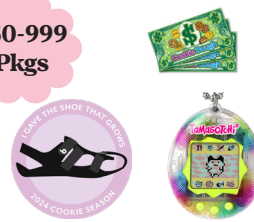
Philanthropic Reward OR Tamagotchi OR $25 Cookie Dough