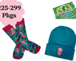
Socks & Beanie OR $5 Cookie Dough