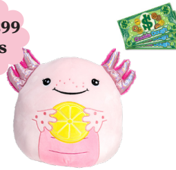
Large Axolotl Plush Pillow OR $10 Cookie Dough