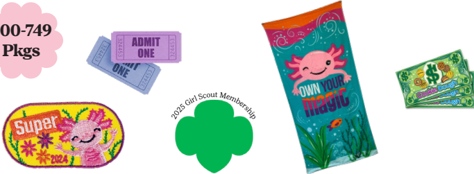
Super Patch, Cookie Event Ticket, 2025 GS Membership & Beach Towel OR $25 Cookie Dough