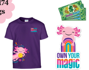
T-Shirt & Vinyl Sticker OR $5 Cookie Dough