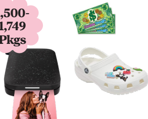
Portable Photo Printer OR Crocs & Jibbitz OR $50 Cookie Dough