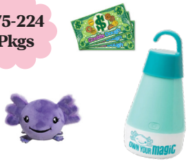
PBJ (color will vary) & Camp Light OR $5 Cookie Dough