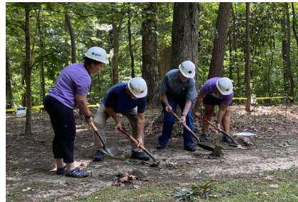
Trailblazer ground breaking ceremony at the Camp Koch 80th Staff Reunion